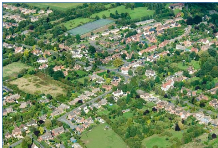
An aerial view of the village centre

A copy of this Neighbourhood Plan can be downloaded from the Welford on Avon Parish Council website. ( www.welfordonavon-pc.gov.uk ):