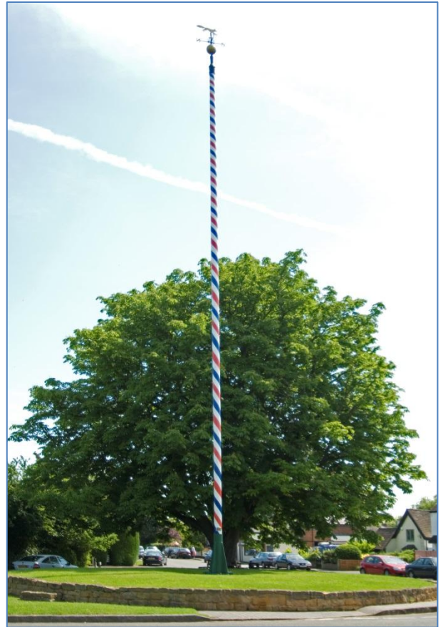
The Maypole at 65ft is one of the tallest in England