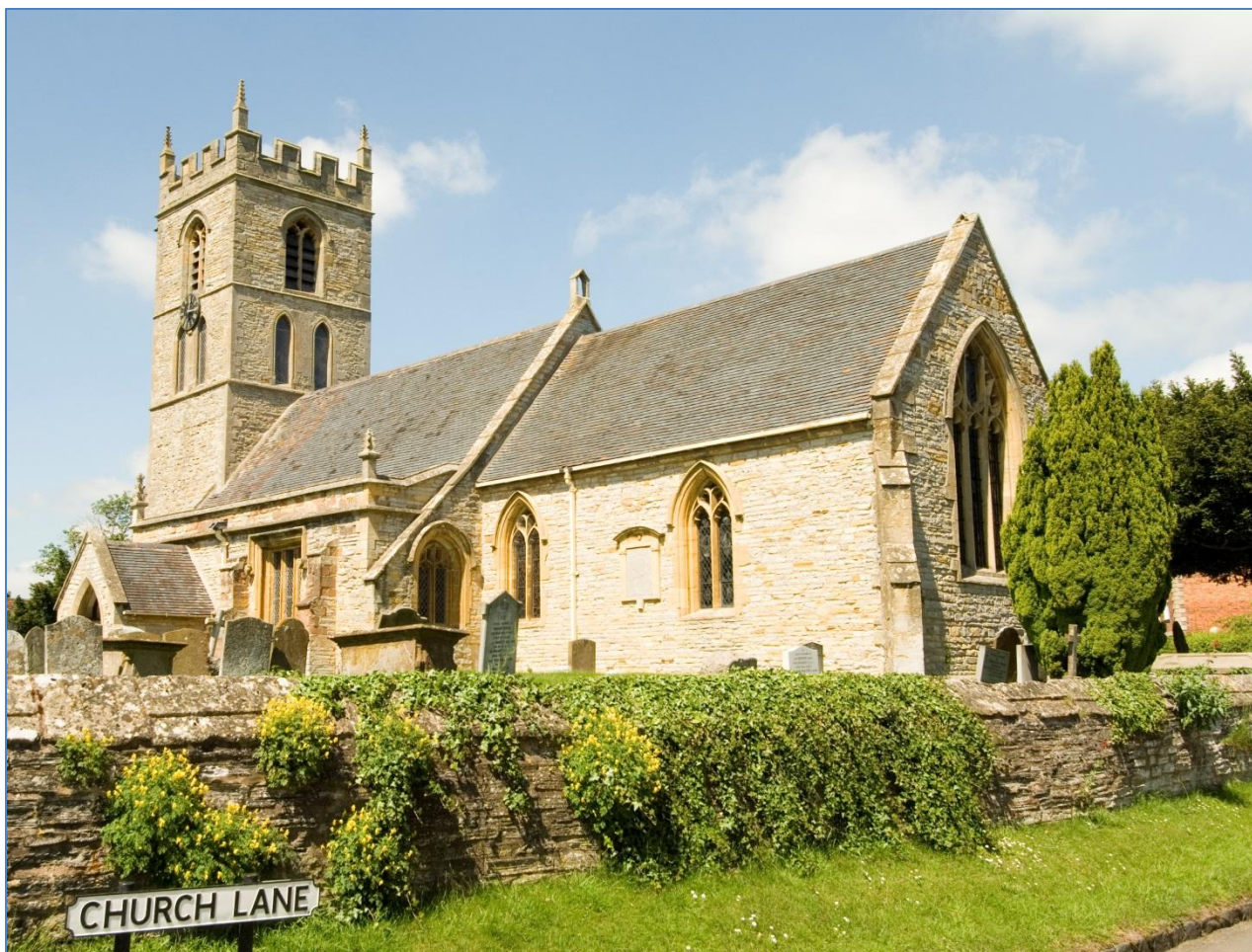
St Peters Church c. 1330-1340

Examination version – draft v6 17 th Nov 13