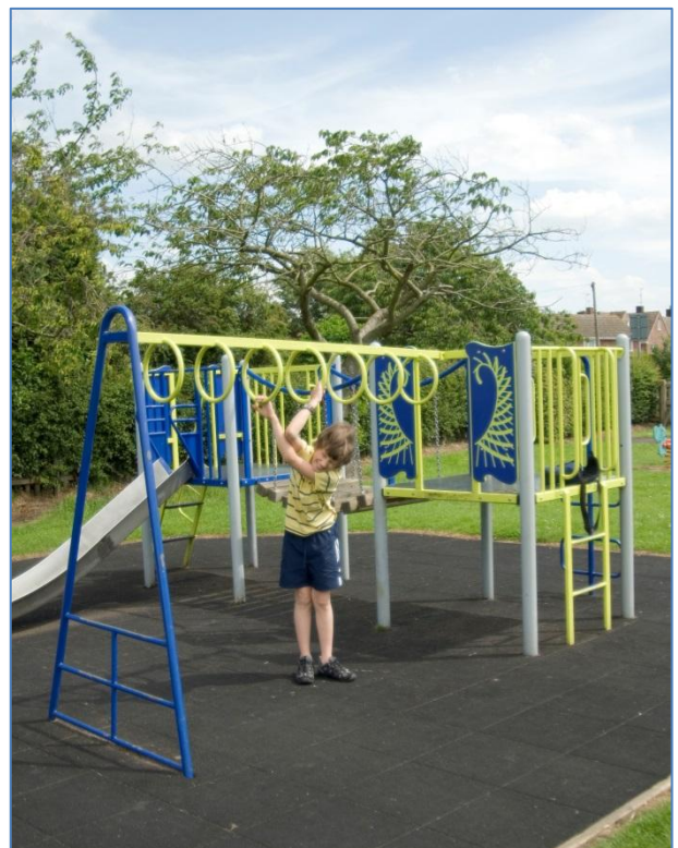
Vision and Objectives for the